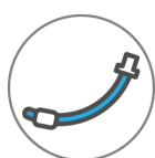
Clamp the ETT