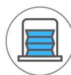
Place on "Stand-By"